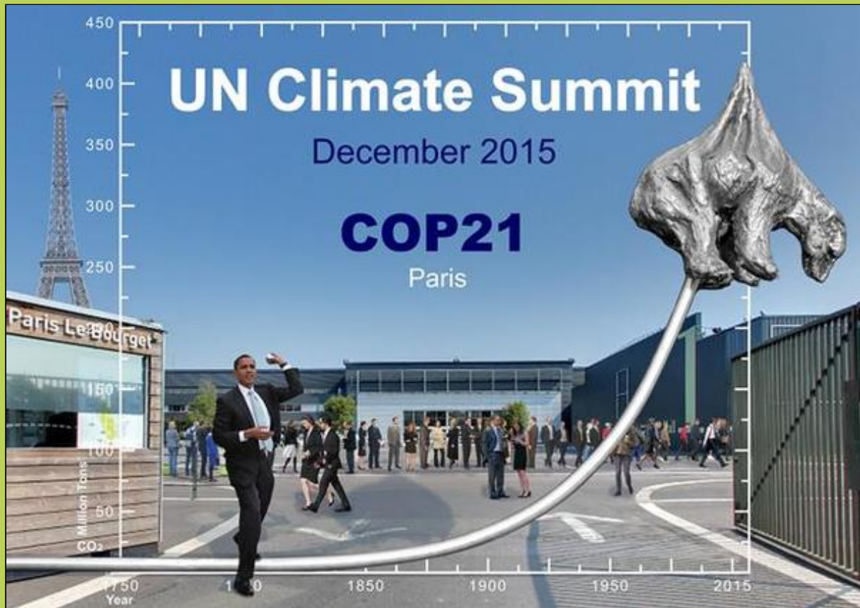
The Sculpture Unbearable: A copper-polar bear impaled on a 6 meter high graph of human CO2 emissions. First exhibition: COP 21 in Paris.