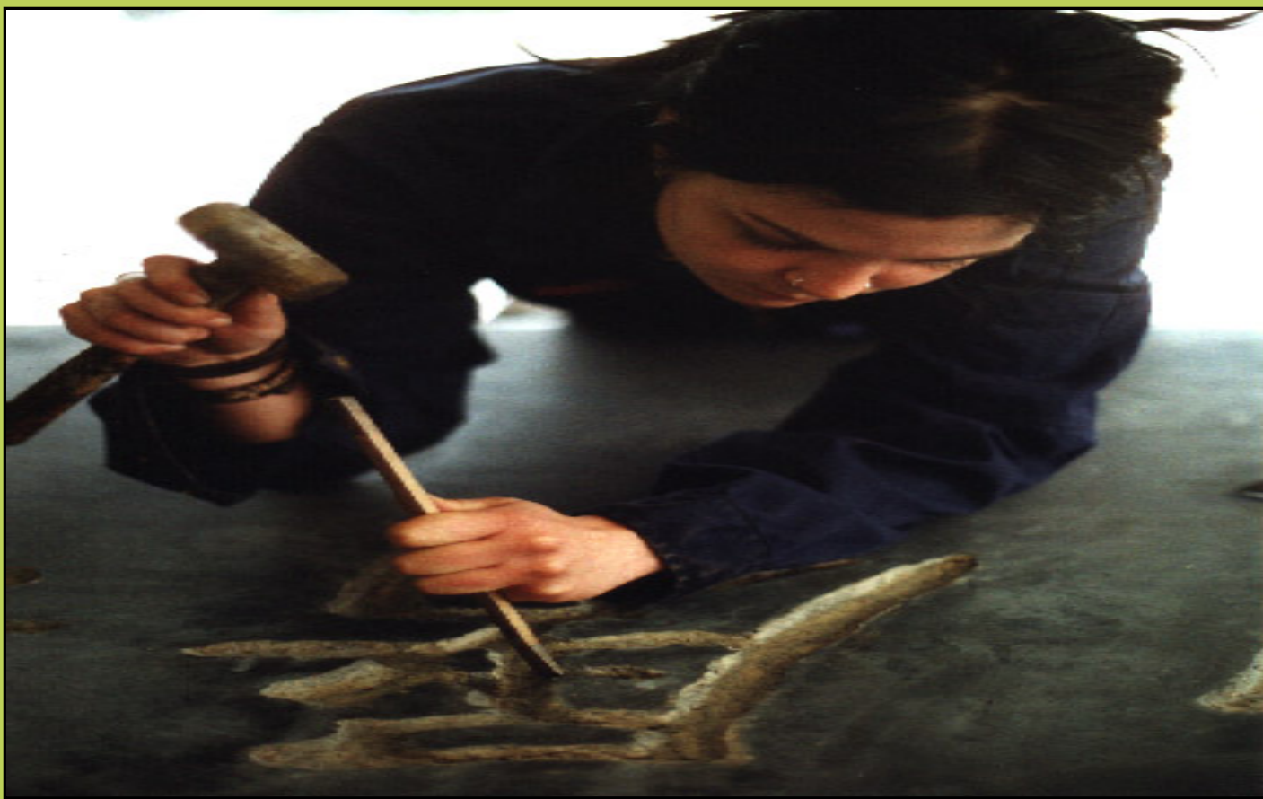
The Chinese sight for "The old cannot kill the young forever" chiseled into the socket on the memorial

Unsubscribe / Change Profile *** Forward this email to a friend *** Click here to view this email in your browser