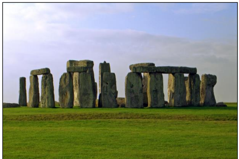
Stonehenge, 4.000 year old, England