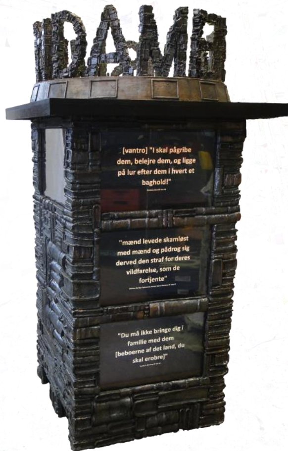
Fundamentalism-model. 10 of these sculptures make sure that the project reaches every corner of society.

Marathon debate: A curator has come up with the idea, of inviting a group of religious people to live in- and outside the sculpture for 24 hours. During the 24 hours specific subjects are presented and discussed. It will all be videotaped and cut for a number of TV-stations. In other words: reality TV but with meaningful content. A documentary film maker is looking into the project at the time of writing.